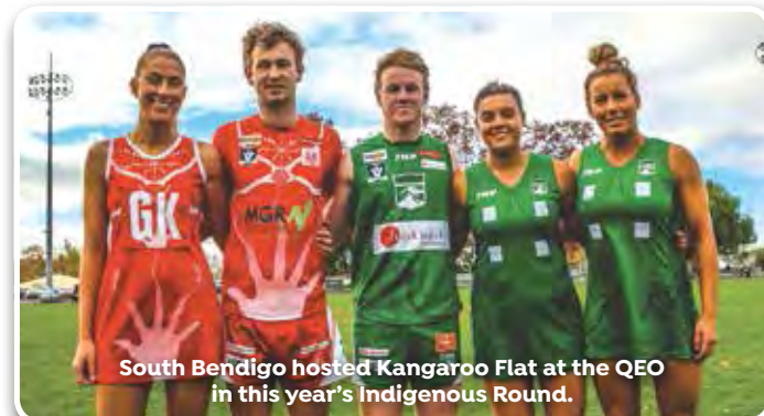
South Bendigo hosted Kangaroo Flat at the QEO in this year's Indigenous Round.

In a competitive A Grade competition in 2019, we witnessed numerous teams bridge the gap on the recent dominance of the Sandhurst team. However, after progressing through to the grand final, the Kangaroo Flat team fell agonisingly short as the Dragons went on to claim their third title in a row. In what was an enormous day for the club, along with the A Grade, flags in the A Reserve and 17 & Under team capped of an impressive 2019 campaign for Sandhurst's netballers. Kangaroo Flat took home the B Grade medal whilst Strathfieldsaye finished victorious in B Reserve.