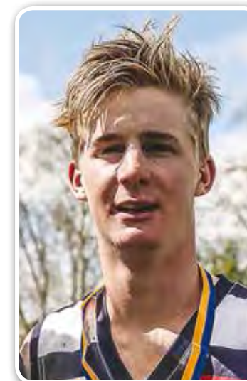
2019 TURNER MEDALLIST