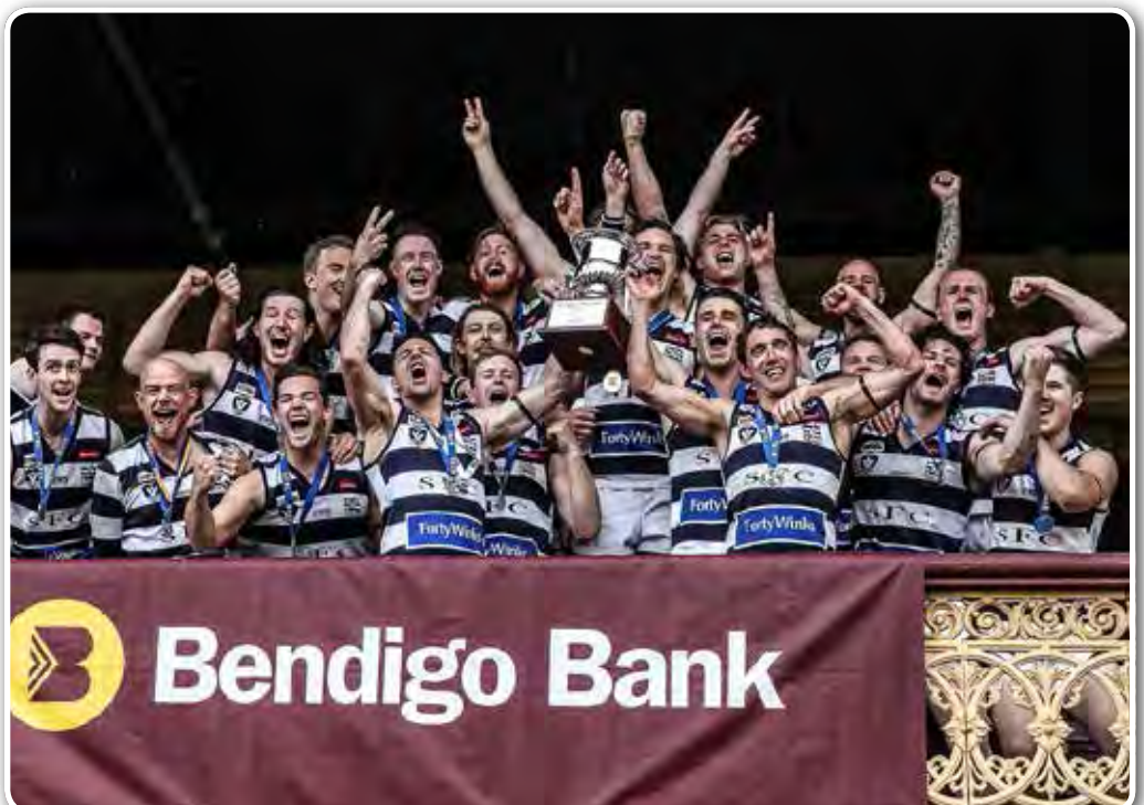
Strathfieldsaye celebrate their premiership win.