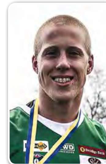
2019 ASHMAN MEDALLIST

His service was recognised by being inducted into both the Carlton Hall of Fame and their Team of the Century. In 2007 he became player welfare officer at Carlton.