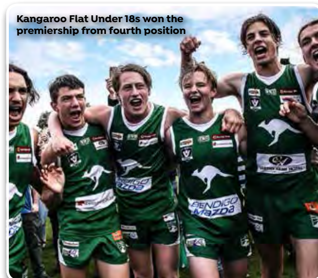
Kangaroo Flat Under 18s won the premiership from fourth position