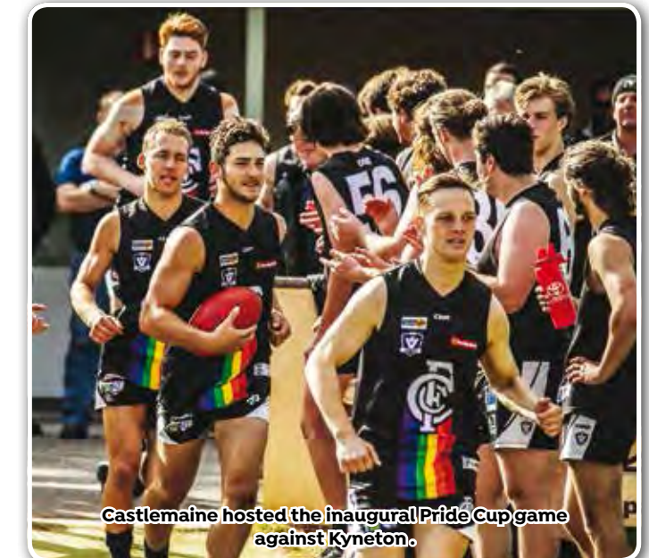
Castlemaine hosted the inaugural Pride Cup game against Kyneton.