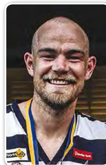
2019 NALDER MEDALLIST

At that point the league decided to continue his memory by recognising the best player on the ground in the grand final.